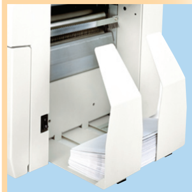
Standard Catch Tray

The FD 2000 is designed for user-friendly operation. Simply set your folds according to the clearly marked settings on the fold plates, load your forms, press start and you're on your way. The FD 2000 has LED indicators for power on, fault detection, paper out and cover open. It also includes a six-digit counter for audit control.