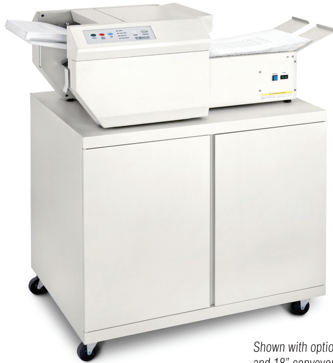
Shown with optional cabinet and 18" conveyor

The FD 2000 AutoSeal ® pressure sealer is a powerful desktop model designed to process pressure sensitive self-mailers. An easy to use touch-pad control panel and three-roller drop-in feed system make this product both practical and dependable. Standard features include a six-digit counter, jog control, fault detection, and LED indicators. Up to 200 forms can be loaded in the hopper and processed at speeds up to 7,000 forms per hour. The FD 2000 also has an optional fully enclosed cabinet for storage and an 18" or 4' conveyor with photo-eye for neat and sequential stacking of processed forms.